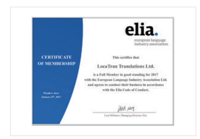
Member of the European Language Industry Association