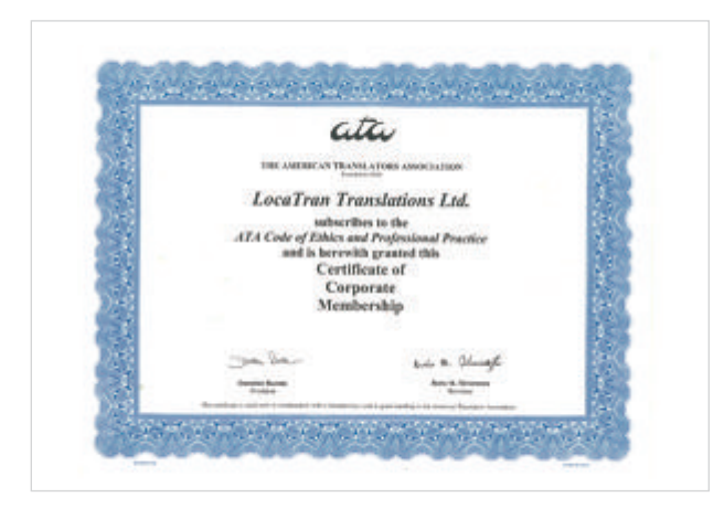
Member of American Translators Association