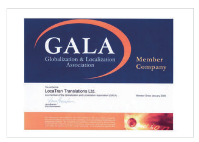
Member of Globalization & Localization Association