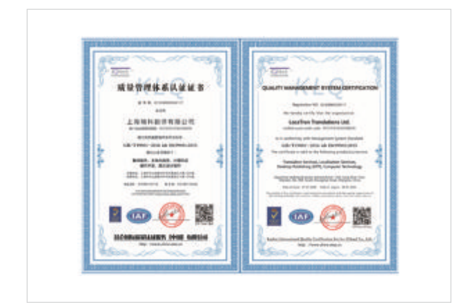
ISO 9001:2015 Certification