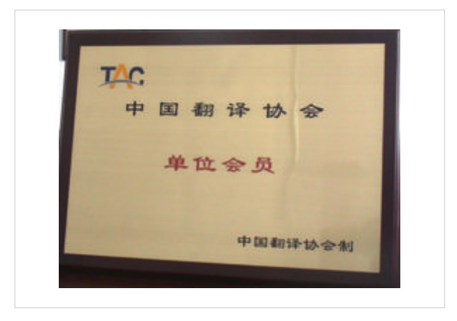
Member of Translators Associations of China